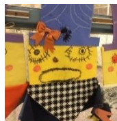
1 st grade 3-D mixed media scarecrows