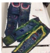
6 th grade: Passion Pants from recycled jeans, jewelry, and paint