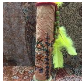
5 th grade: Native American Talking