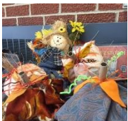
Jr. Kindergarten and Kindergarten soft sculpture Pumpkins

We also have authentic looking Native American talking sticks, Picasso inspired self-portraits, and 3-D soft pumpkin sculptures. Don't miss the spooky trees and comedic gravestones in the lunchroom. Happy Fall y'all!