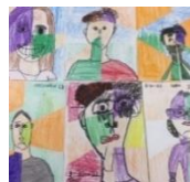
3 rd grade Picasso inspired Self-portraits