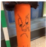
2 nd grade Folk Art Pumpkins