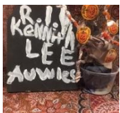
4 th grade: Origami Spooky trees and comedic