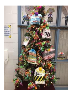
Winter Hat Tree 4th Grade