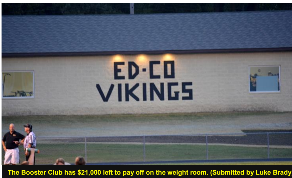
The Booster Club has $21,000 left to pay off on the weight room.