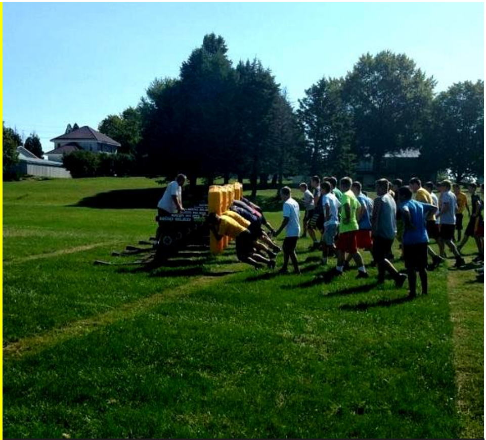
The new 7-man sled. Thanks to the joint effort from Edgewood Chamber of Commerce, Ed-Co Booster Club, & Alumni Football team.

The game will be both JV and Varsity versus MFL MarMac in Colesburg. JV game will start at 4:00pm with the Varsity starting afterwards. There will likely be more information out on this before the event so stay tuned to social media to find out more.